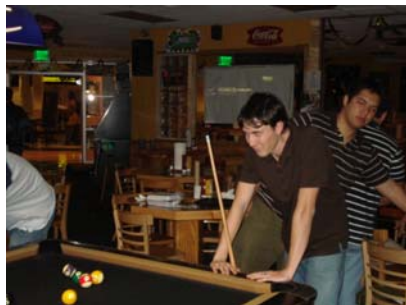
Students Shooting a Game of Pool at the ASHRAE at UCF Social

Tuesday, November 23 rd marked the first social event held by the ASHRAE at UCF chapter. The event was held on campus, at Wackadoo's in the student union. Students came by to shoot some pool, enjoy some snacks, and socialize with their peers and local professionals. The event was sponsored by Johnson Controls, Stan Weaver Company, Florida Hospital, Peninsula Engineering and Tom Barrow Company. Thanks to Wackadoo's and our sponsors for helping to make this event a success!