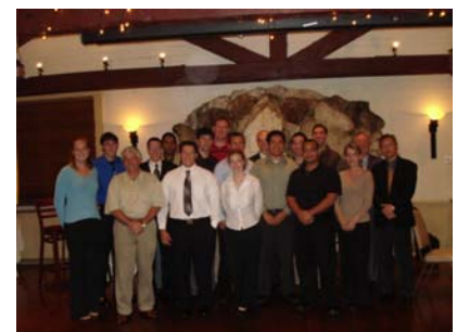
Students Attending November's Chapter Meeting

November's chapter meeting marked the largest turnout of students we've ever had at a monthly meeting. Fifteen students came to see the panel discussion about refrigerant phase out and network with local industry professionals. Thank you to all the companies and individuals who make it possible for CFL ASHRAE to host these students. If you would like to help ASHRAE continue to support our students, please visit our chapter website, www.ashrae-cfl.org , and sponsor a student dinner.