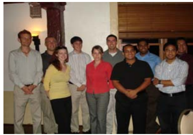
Students Attending October's Chapter Meeting

October's chapter meeting was Student Night and the UCF Students were there in full force. Eleven students turned out for the meeting, including many new faces. We are happy with the turnout and thank everyone for their support. If you would like to help ASHRAE continue to support our students, please visit our chapter website, www.ashrae-cfl.org , and sponsor a student dinner.