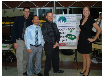
Student Selection Team 2

Thank you to all of the mentors who have helped guide the students throughout this project.