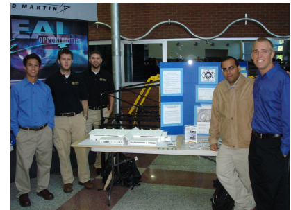
Student Selection Team 1

Our UCF Senior Design teams have completed the ASHRAE International Student Design Competition and submitted their entries to our chapter for review.